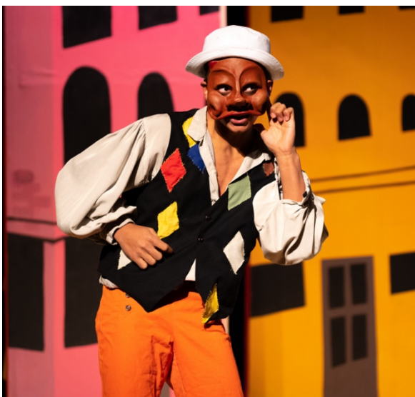
DRAMA 10 (MDRM-10)

In Drama 9, students will build upon the skills introduced in Drama 8. The key word is STORYTELLING. This course is designed to develop awareness, confidence and self-esteem, through artistic collaboration and creative play. Though games and activities, students will learn to problem solve and gain greater self and social awareness. The course is not performance based; rather the emphasis is on participation and creative play. Units of study include radio plays, play-building and stage combat.